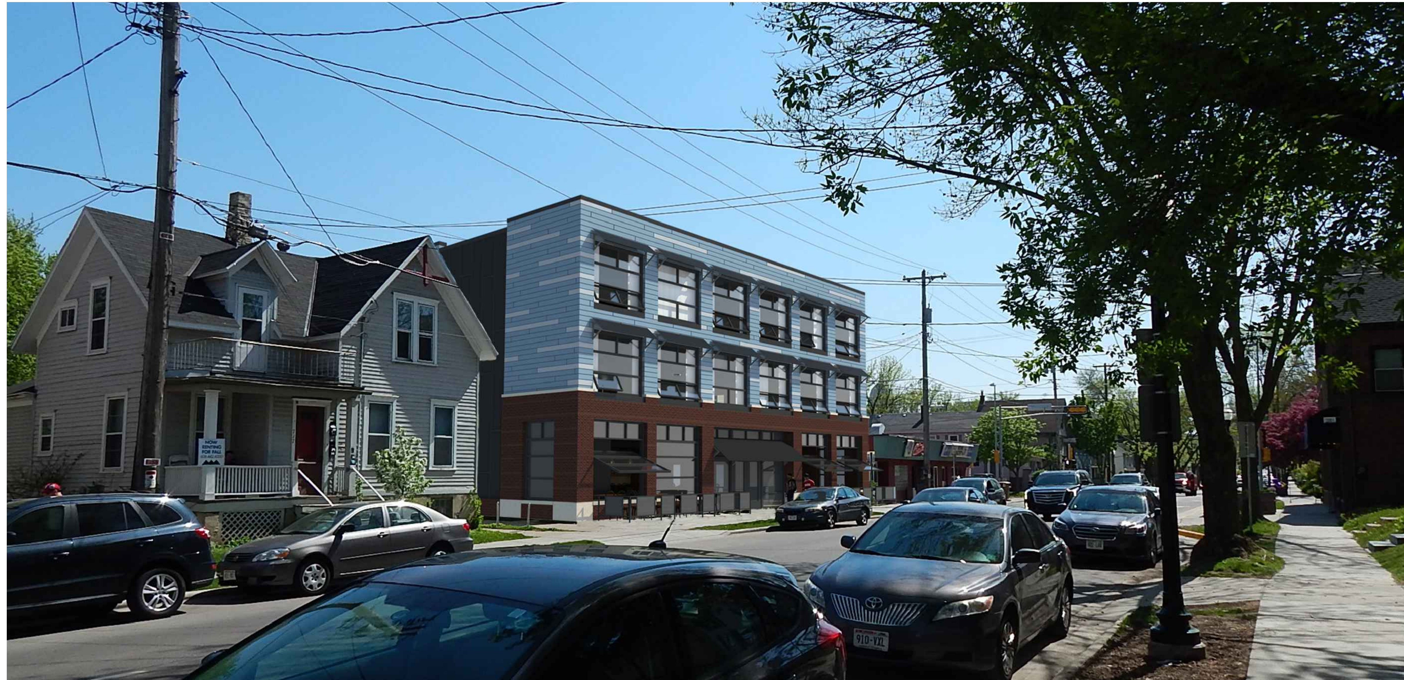
VIEW LOOKING SOUTH ACROSS JOHNSON STREET