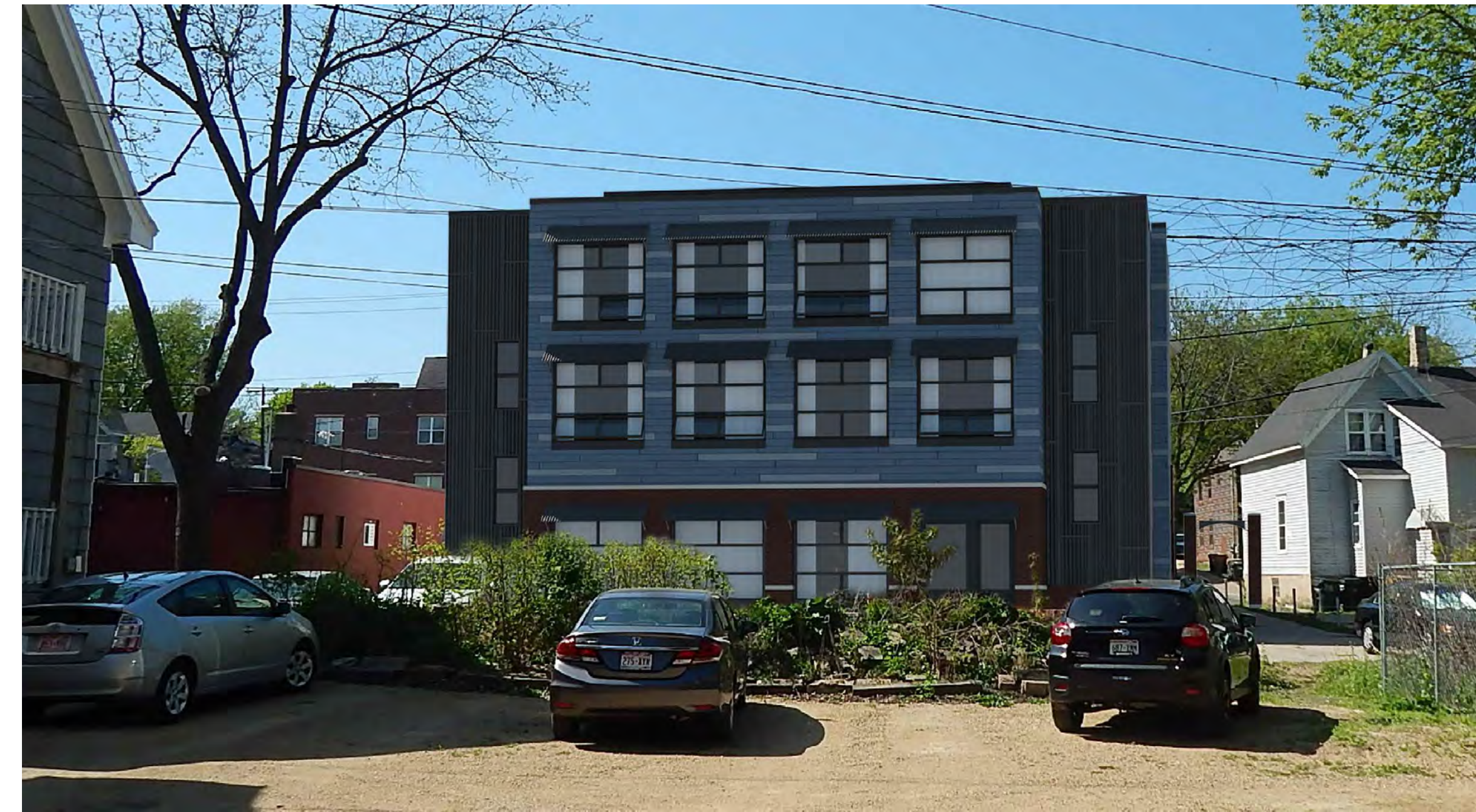
VIEW LOOKING NORTH-EAST FROM BACK LOT