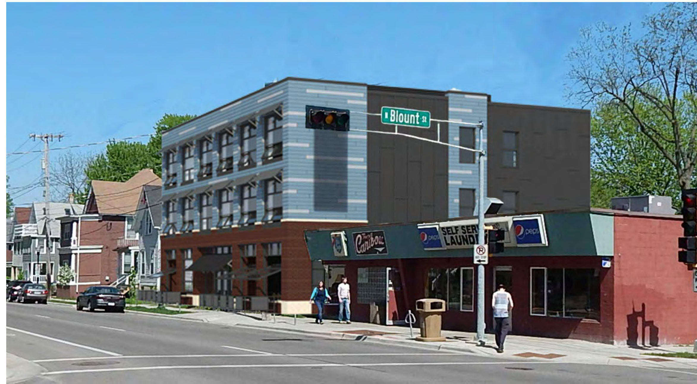
VIEW LOOKING EAST FROM BLOUNT & JOHNSON STREET