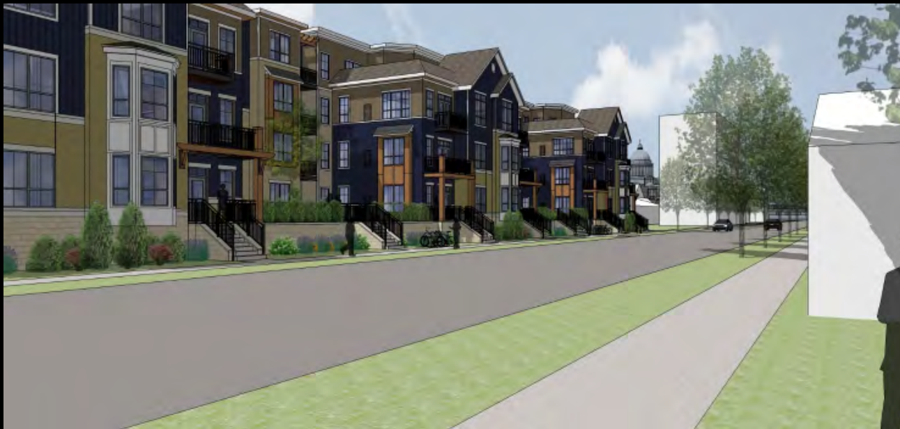
DAYTON STREET – TOWARDS CAPITOL