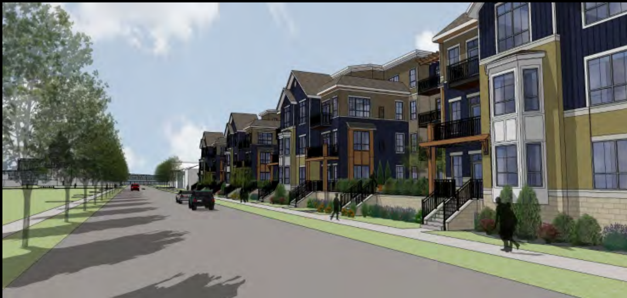
MIFFLIN STREET – TOWARDS CAPITOL