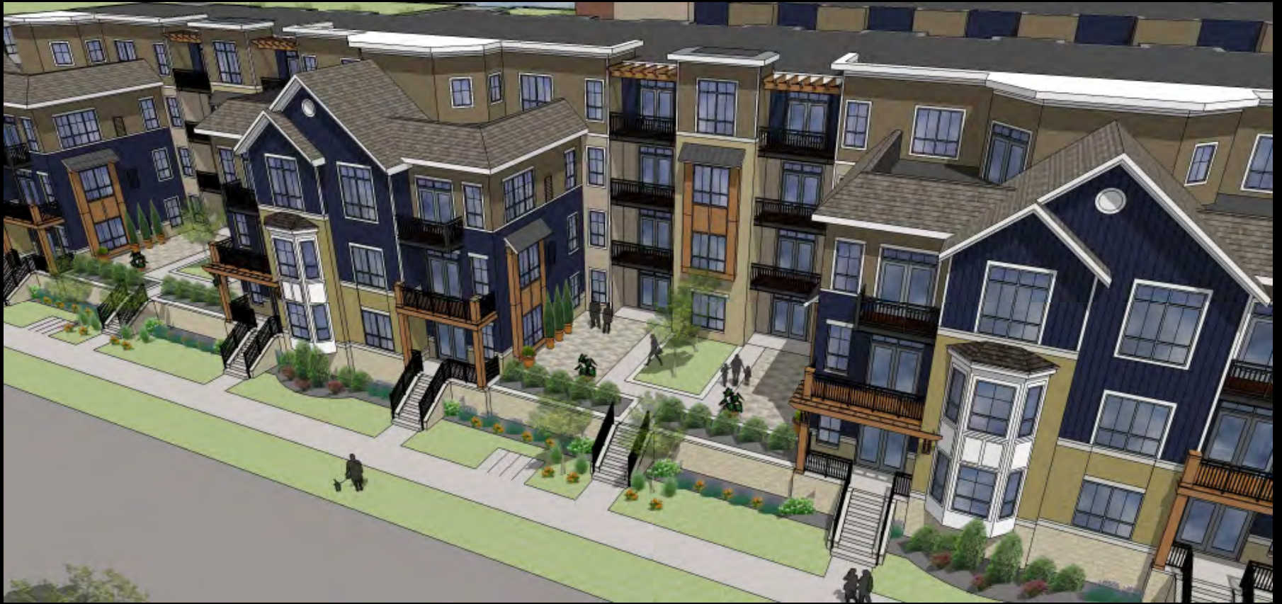
MIFFLIN STREET – COURTYARD BIRDSEYE