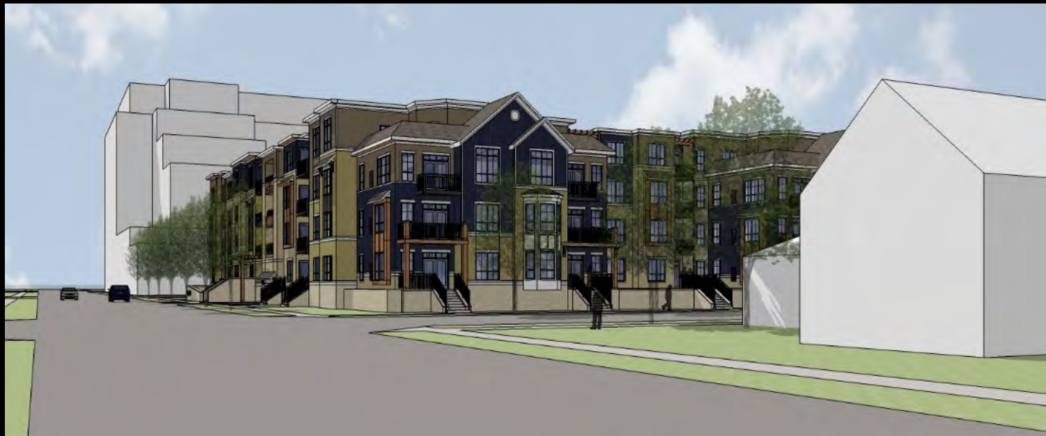
LIVINGSTON STREET – TOWARDS E WASH