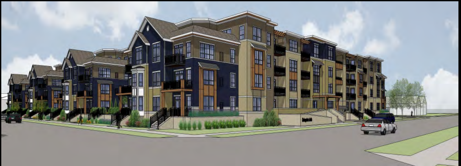
MIFFLIN AND LIVINGSTON STREET CORNER PERSPECTIVE