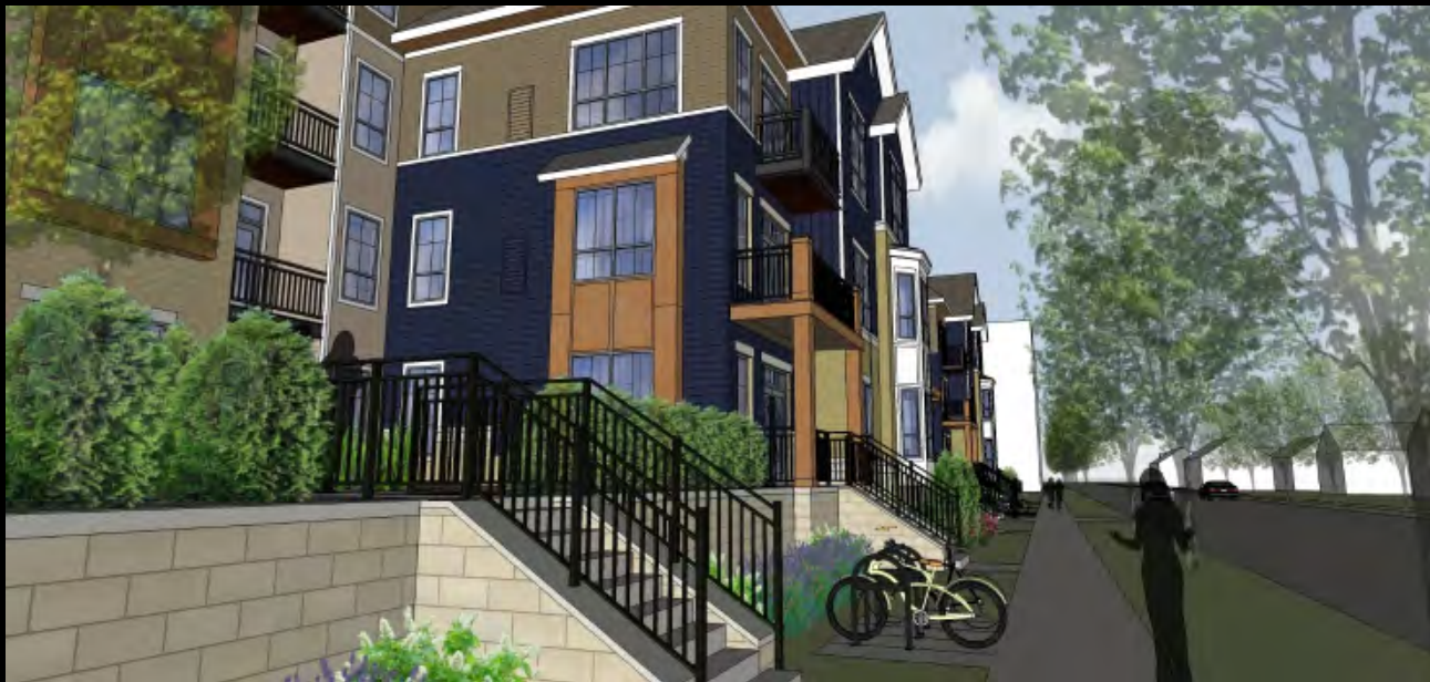
DAYTON STREET – WALKUP PERSPECTIVE