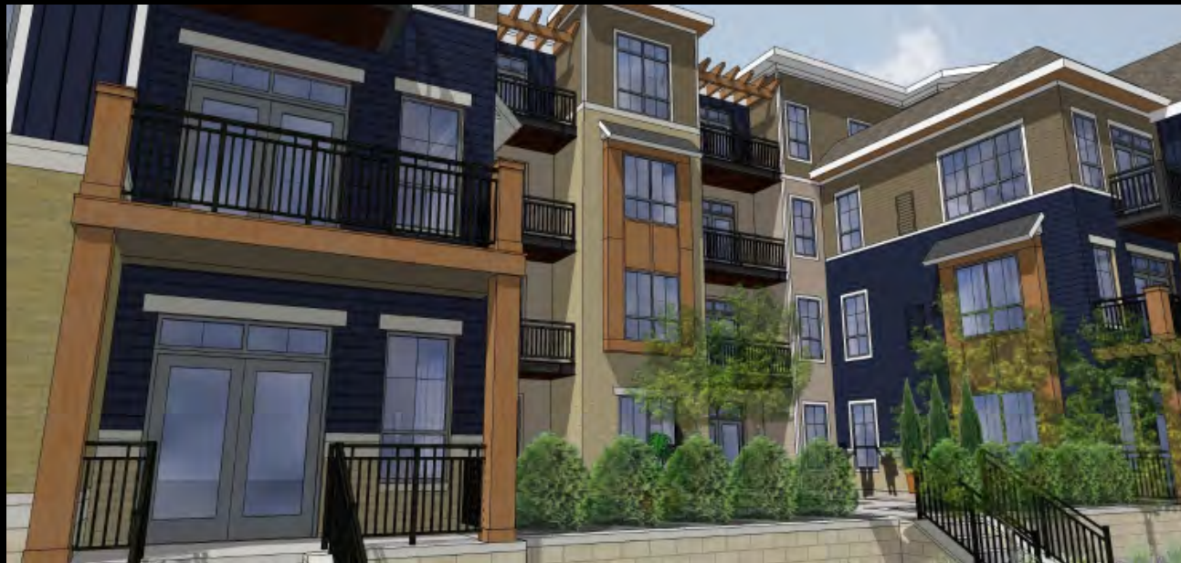
MIFFLIN STREET – COURTYARD WALKUP