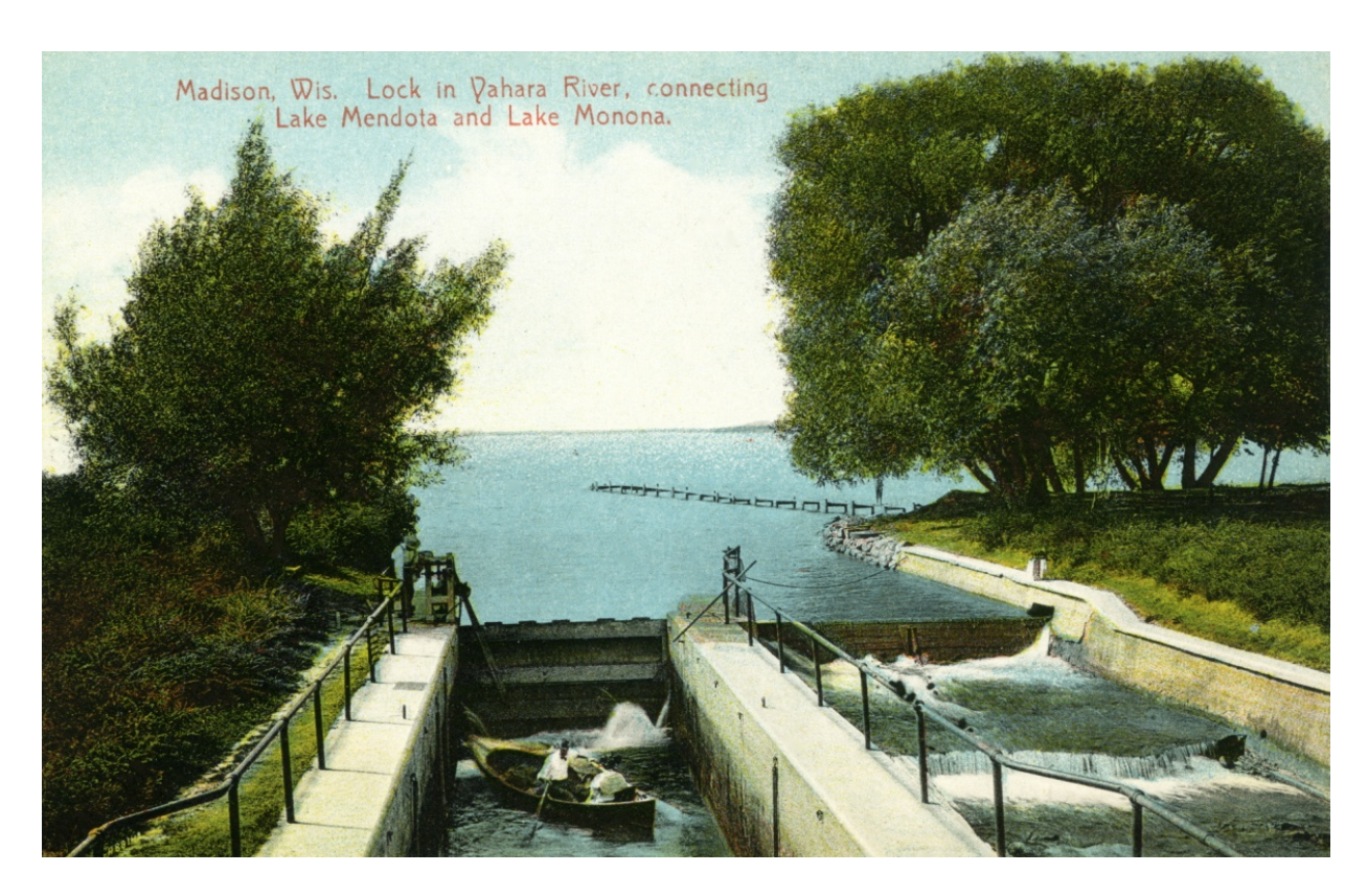
The Yahara River lock and dam built in 1906 and replaced with current locks in 1958 and updated in 2006. No postmark date. Publisher: The Hugh C Leighton Co Manufacturer, Portland Me.