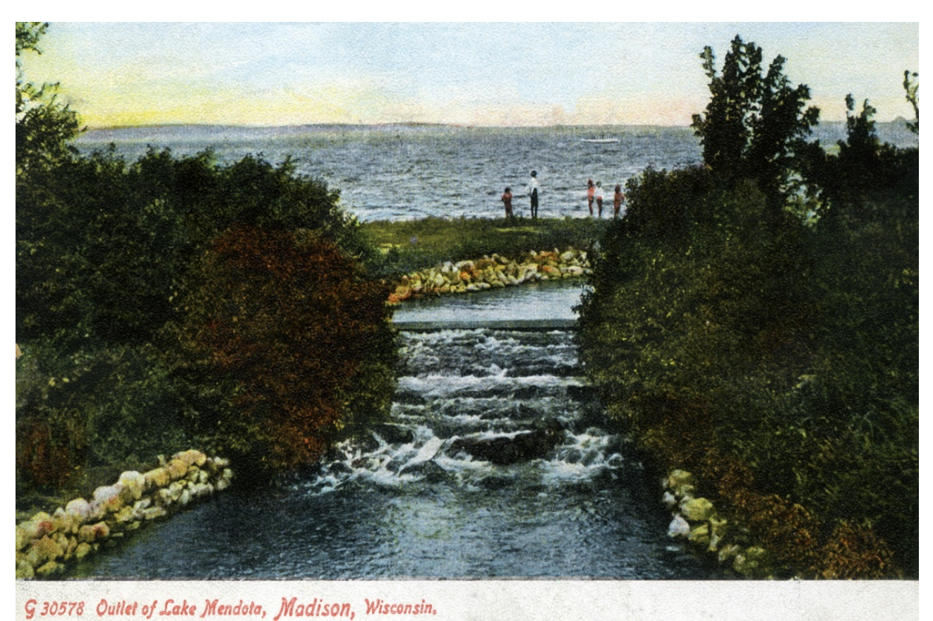
A spillway carried water from Lake Mendota around a mill and into the Catfish (Yahara) River. Used prior to 1903, postmarked 1907. Publisher: The Rotograph Co, NY City.