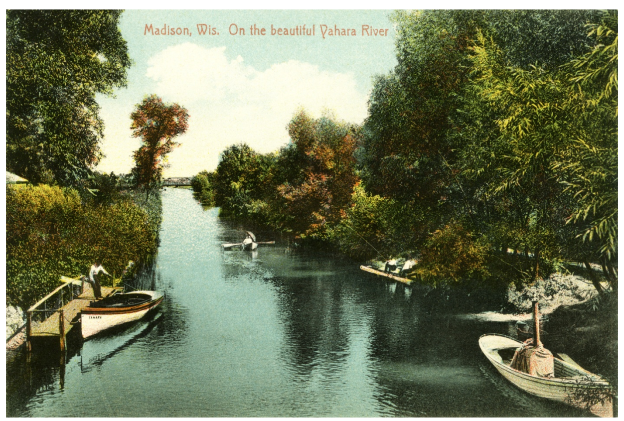
The Yahara River, postmarked 1912, Publisher: The Hugh C. Leighton Co Manufacturers, Portland, ME, U.S.A.