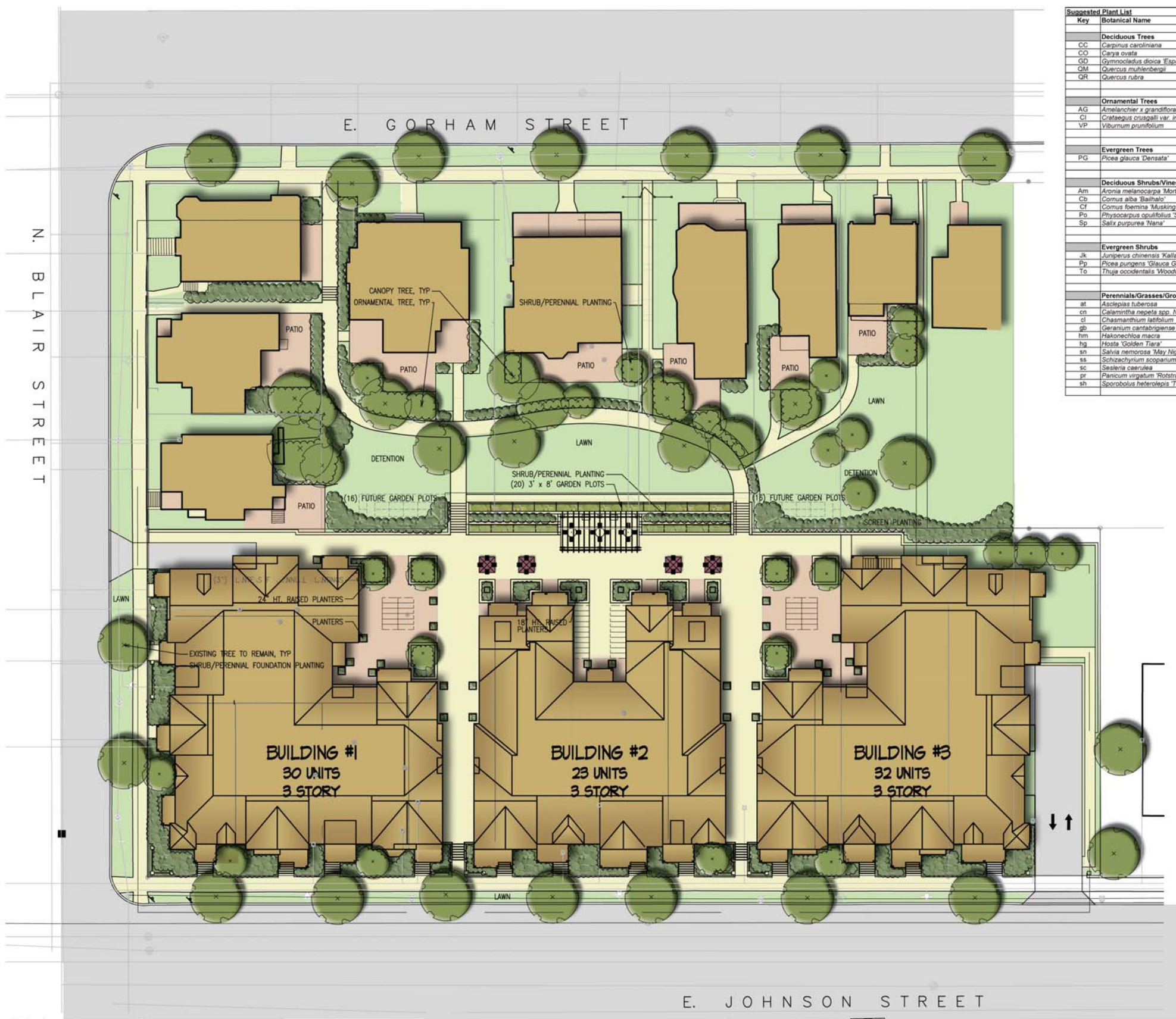
Landscape Plan 1" = 20'-0"