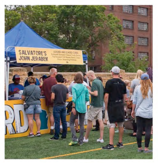
CURDFEST 7,000+ ATTENDEES