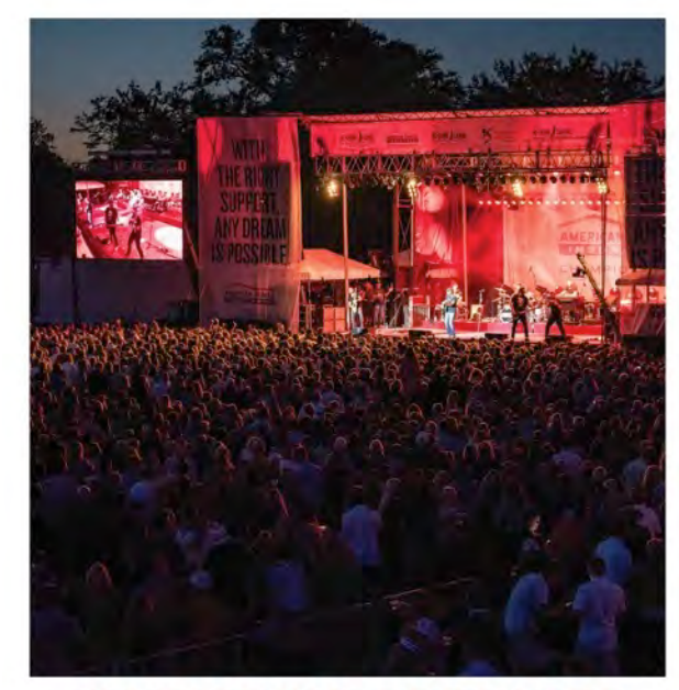
MADISON'S PREMIERE OUTDOOR CONCERT FACILITY