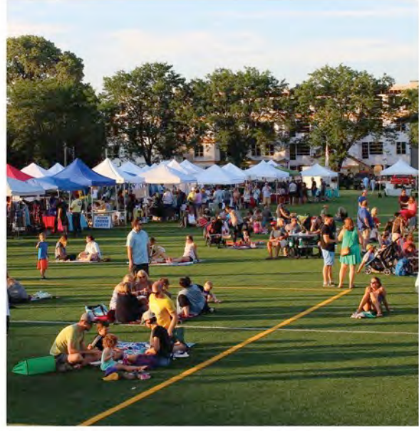
BODEGA Over 60 vendors & Live Music