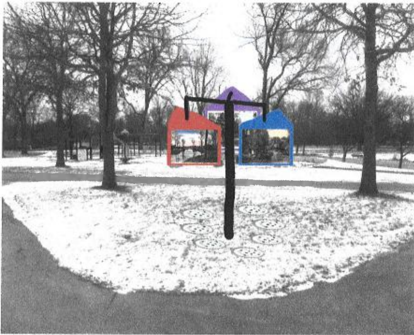
Each rotating colored triangle holds 3 Images Each Image is 24" by 16"

Placement: In the center of the island, near the playground and also near the sidewalk